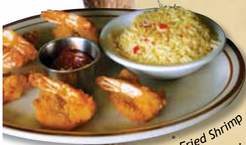
French Fried Shrimp

Shrimp with a 4 star rating! Light and crispy. Includes salad bar and choice of rice, sweet potato fries or french fries. 11.99